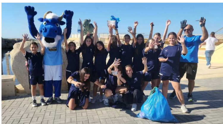
Pafos FC Academy partaking in Underwater Cleanup from plastic

in the last 2 years, reinforcing our focus on grassroots and player development.